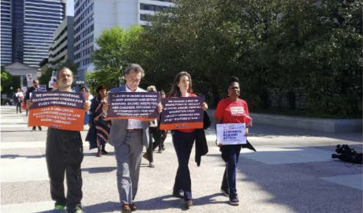
Jack and Jill Day on the Hill