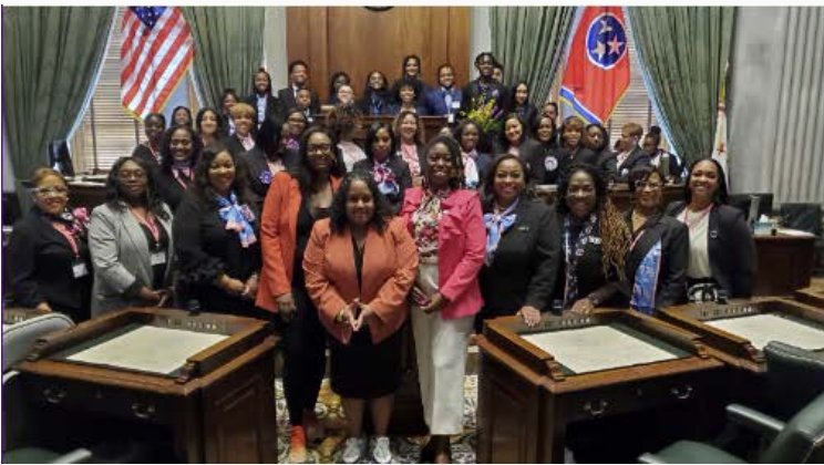
AKA Day on the Hill