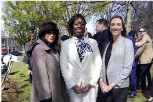
MLK High School Receives the Anne Dallas Dudley Award for 100% Voter Registration