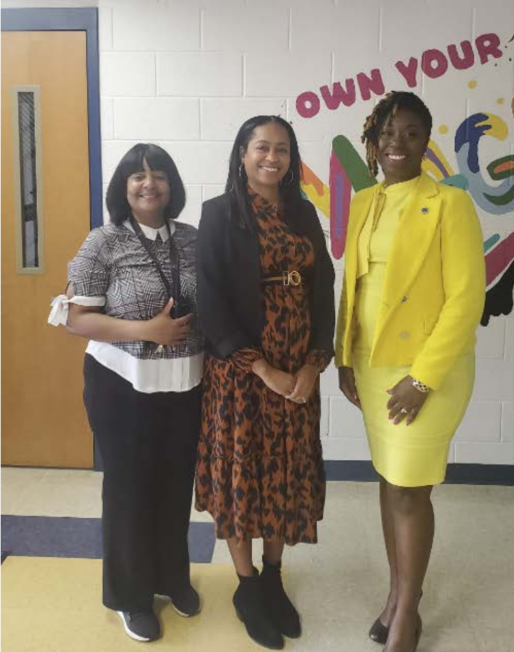
Sen. Oliver honored at Women Who Rock Nashville