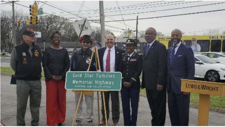
Street Naming for Gold Star Families w/ Rep. Love