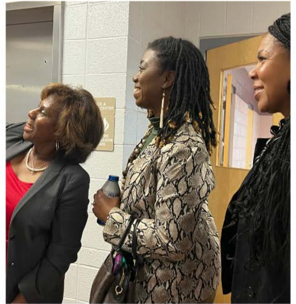
East End Prep Unity Day