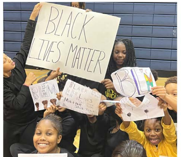
DCYD Social Hour