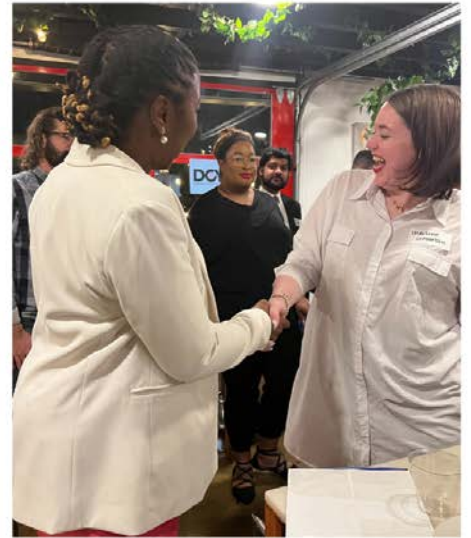
African American Heritage Society Gala