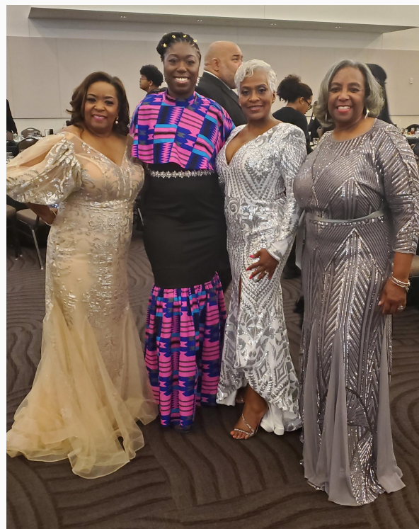
IMF's 33rd Annual MLK Day Convocation at Tennessee State University