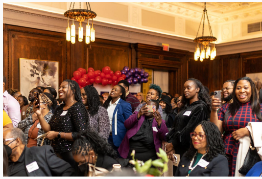
Legislative Leader's Academy in Knoxville