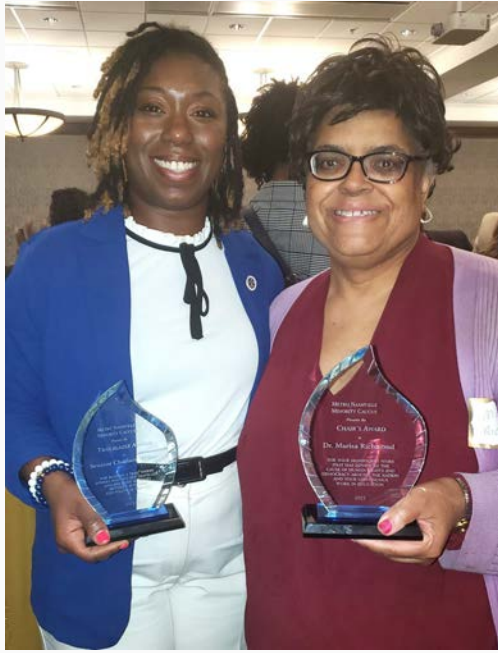
HBCU Day on the Hill