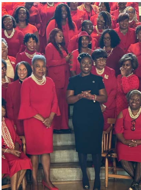
Black History Month Panel Discussion at Islamic Center of Nashville