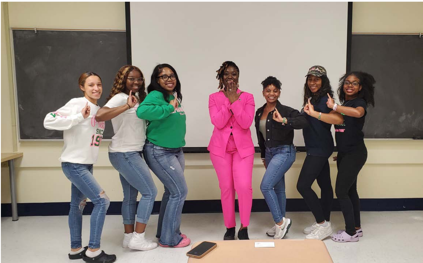
Delta Day on the Hill