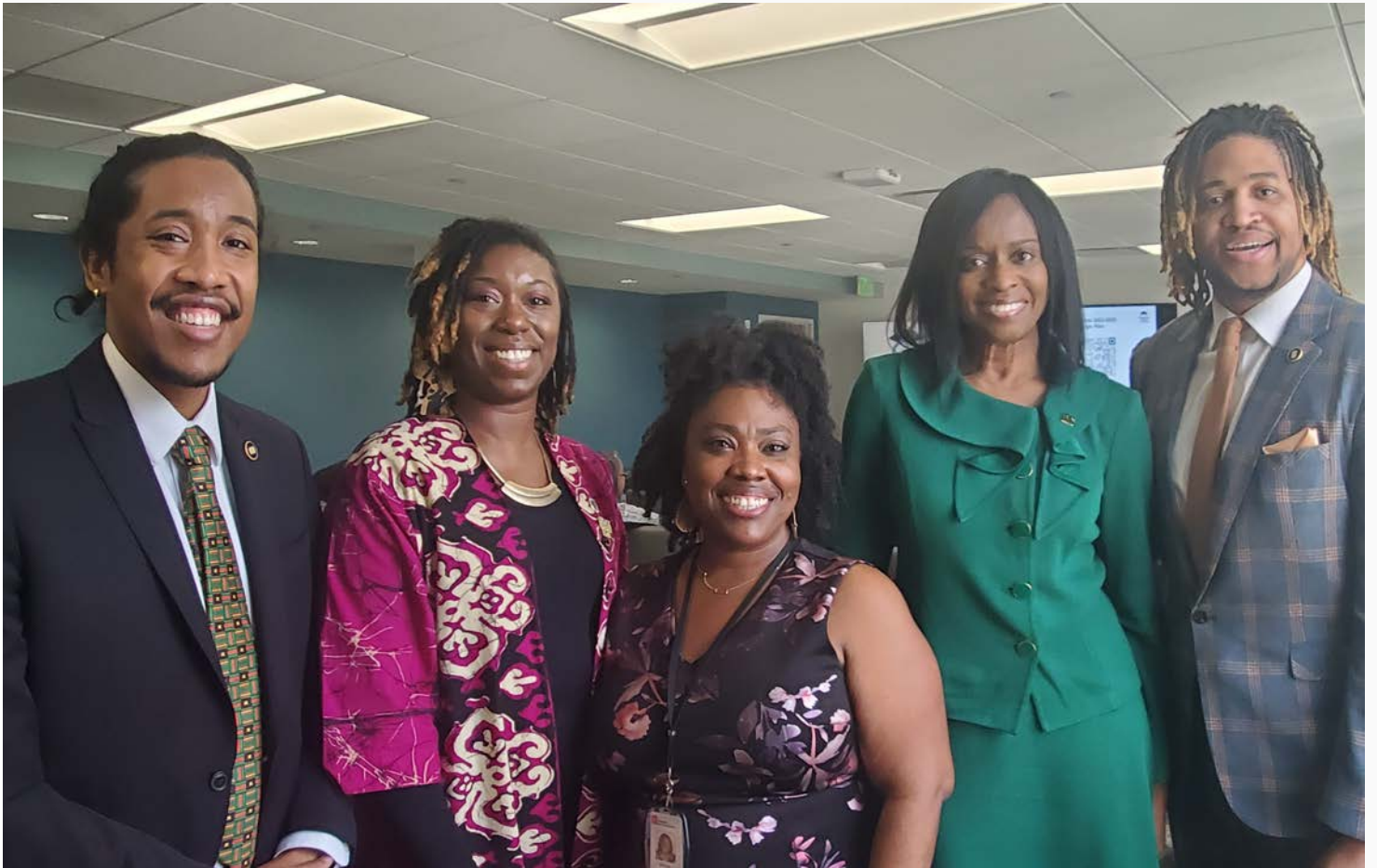
League of Women Voters Luncheon