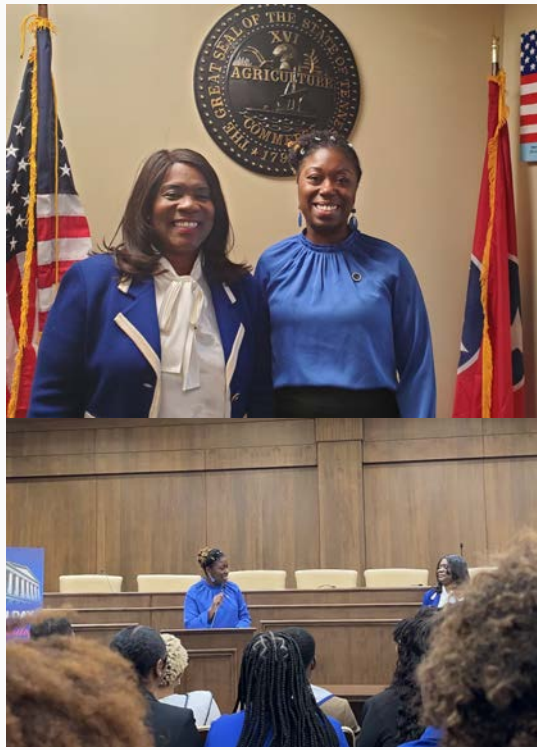
Senator Oliver Receives 'Trailblazer Award' from Metro Council Minority Caucus