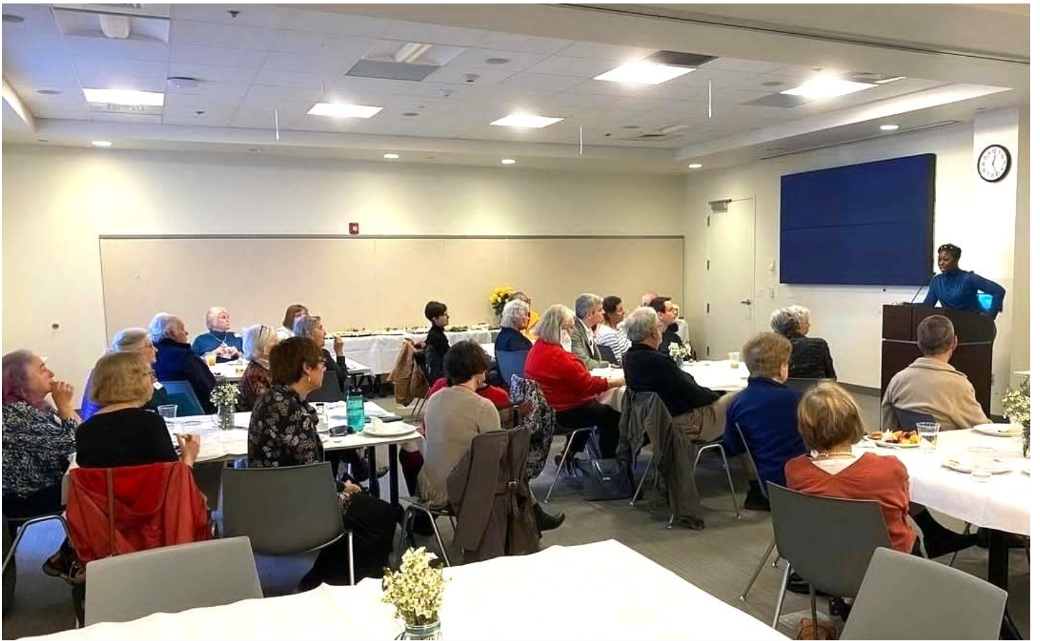
Meets Freedom Rider & Civil Rights Activist Bernard Lafayette and Films Belmont Student Documentary